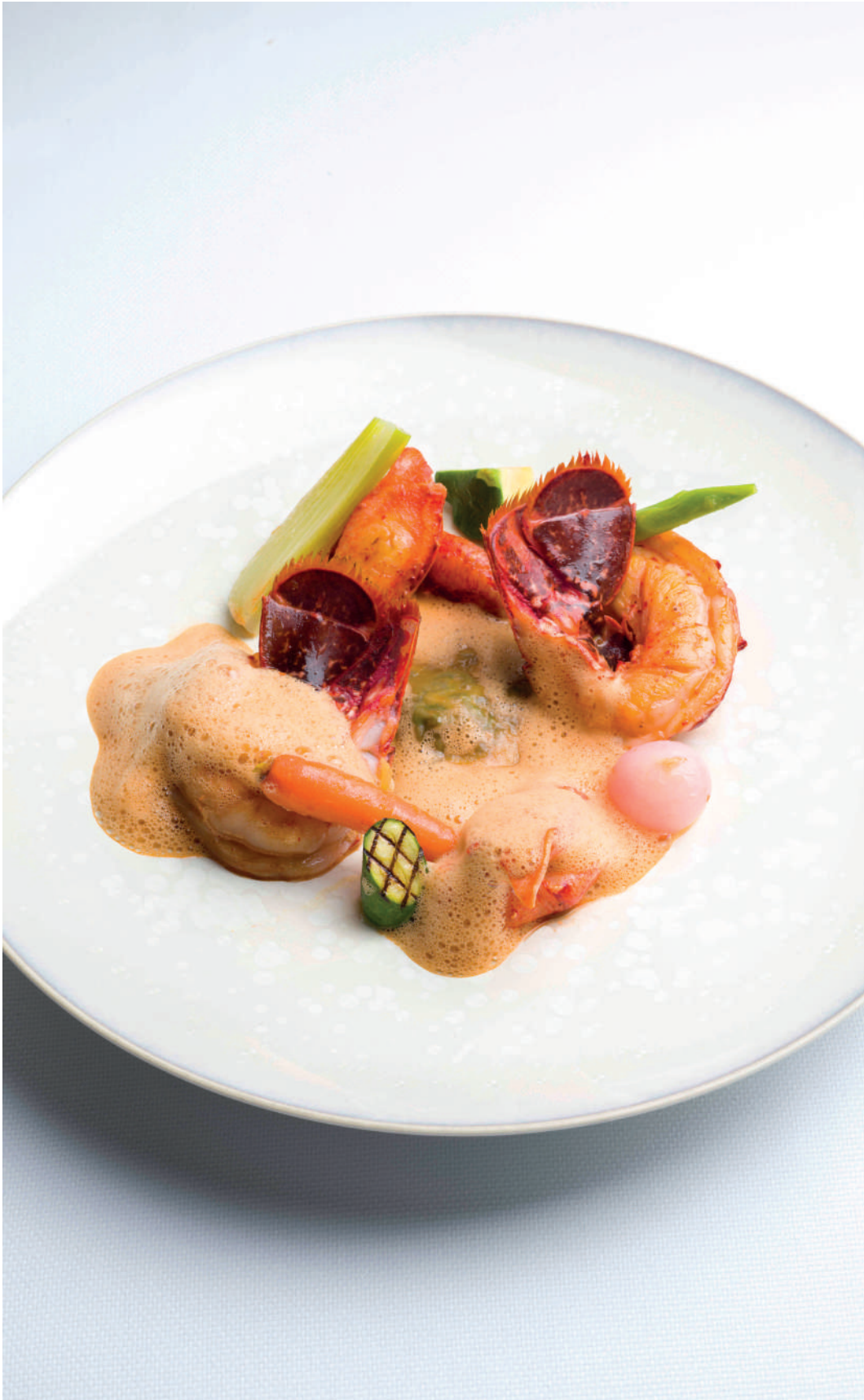
≈ THE LOBSTER STEW ≈