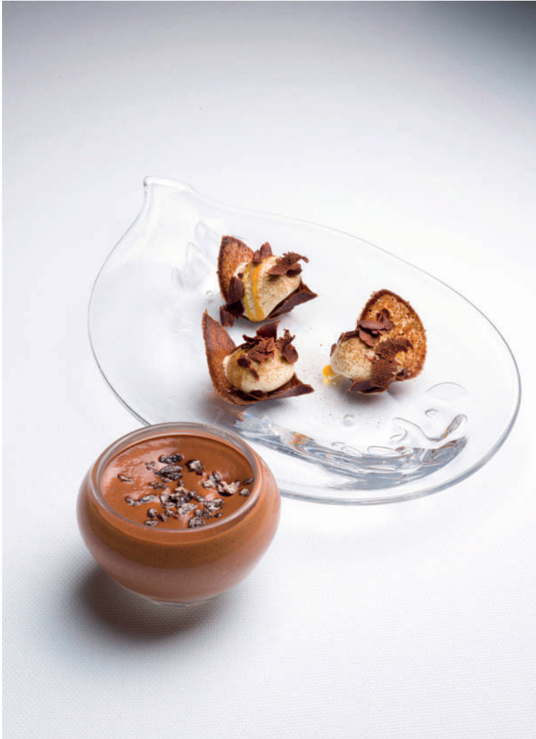
≈ NORI SEAWEED FROM THE ILE DE RÉ, AND HOT COLD CHOCOLATE ≈