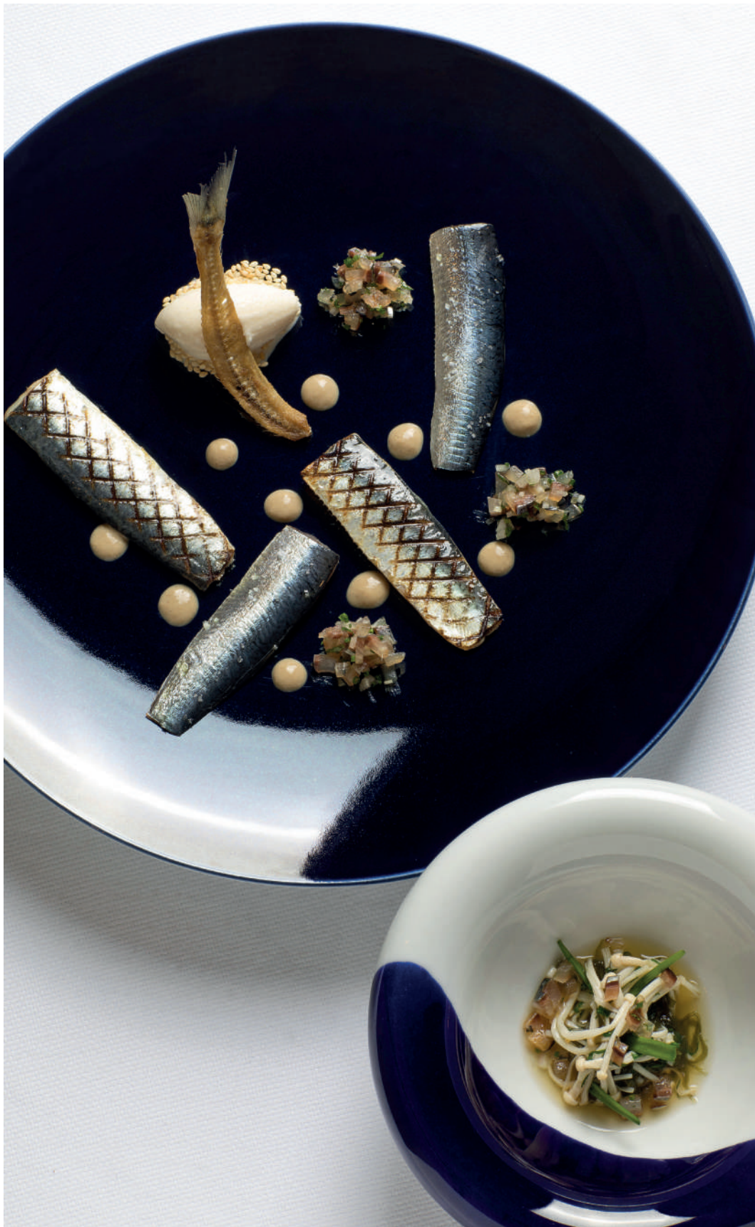
≈ HEAD-TO-TAIL SARDINES, BOUFFI-FLAVOURED ICE CREAM ≈